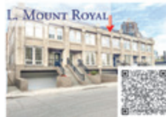
1713 College Lane Listed at $998,000