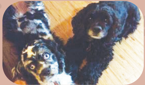
Blue and Jere, Mount Pleasant