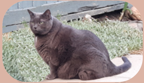
Big Earl, Capitol Hill