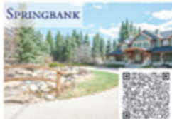
103 Mountain River Estates Listed at $4,200,000