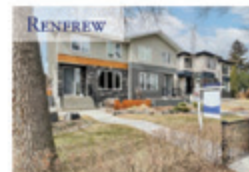
913 Rundle Crescent Listed at $824,000