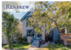
605 10 Avenue NE Listed at $434,900