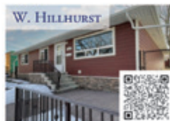
2231 Sumac Road Listed at $1,299,000