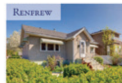
602 8 Avenue NE Listed at $744,900

“KEEPER, A Trusted Name in Real Estate ”