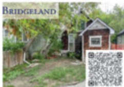
56 6 Street NE Listed at $524,900