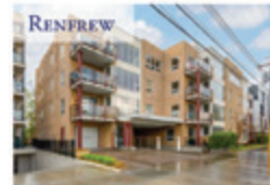
103 603 7 Avenue NE Listed at $327,000