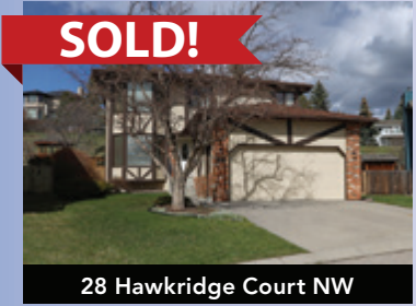
4 Bdrms Up, Backs on Greenbelt $679,900