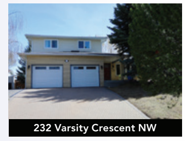
Updated 5 Bdrms, Fully Finished $1,249,900

3D tours, detailed floor plans, plus much more with our proven marketing and state-of-the-art technology. Call for your free home evaluation today!