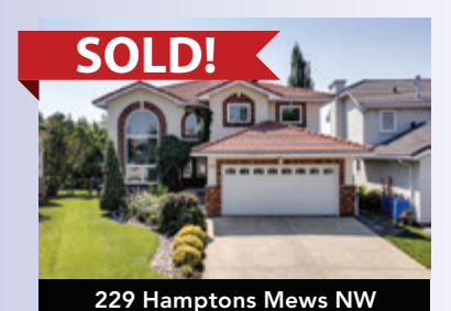
Renovated 4 Bdrms, Backs on Park $1,180,000