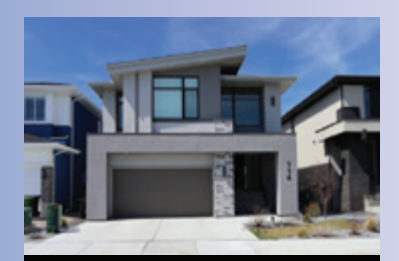
114 Rock Lake Heights NW

Upgraded 6 Bdrms, Fully Finished $1,574,900