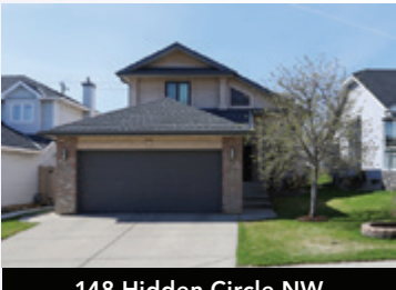
148 Hidden Circle NW

6 Bdrms + Den, Finished Walkout $2,499,900