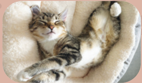
Ravioli, Lower Mount Royal