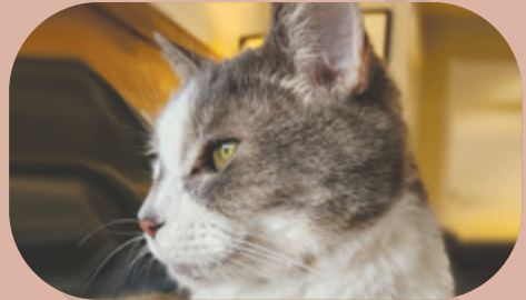
Squeeks, Mount Pleasant