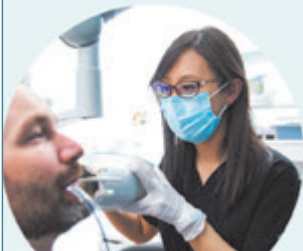
All services provided by a general dentist