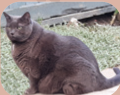
Big Earl, Capitol Hill