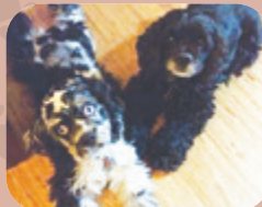
Blue and Jere, Mount Pleasant