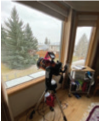
Orion nebula: through two panes of glass

by Patricia Jeffery © 2023, Calgary Centre of the Royal Astronomical Society of Canada