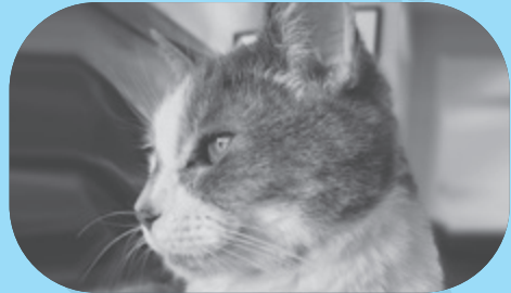
Squeeks, Mount Pleasant