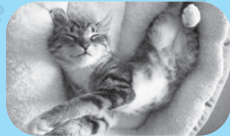
Ravioli, Lower Mount Royal