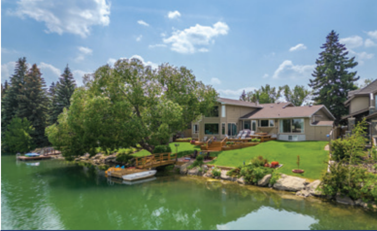
532 Lake Moraine Green SE