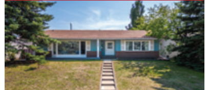
115 Lake Wasa Place SE

Not intended to solicit properties already listed for sale