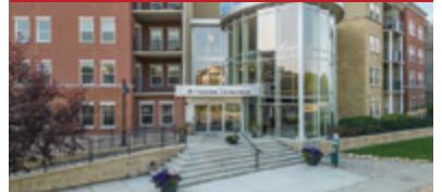
2511, 11811 Lake Fraser Drive SE