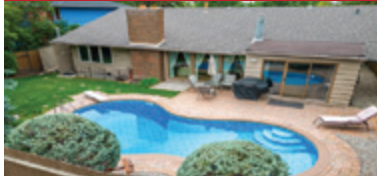
12204 Bonaventure Drive SE