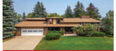
616 Lake Simcoe Close SE