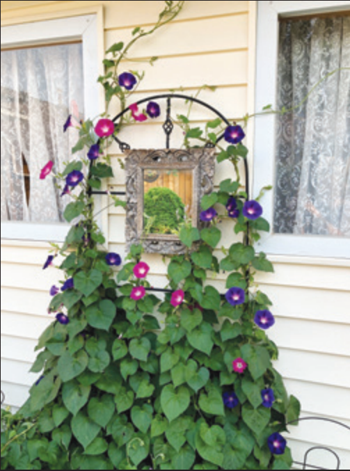
Morning Glory