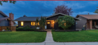
1126 Lake Christina Way SE