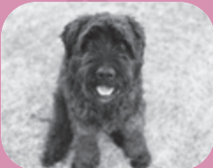
Bisous, Deer Run