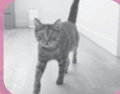
Nacho, Panorama Hills