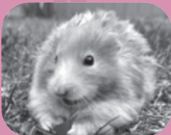
Biscuit, Deer Run