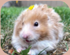
Biscuit, Deer Run