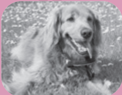
Chile Mango Bean, Sundance