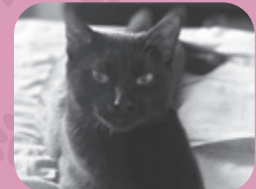
Stormi, Deer Ridge

To have your pet featured, email news@mycalgary.com