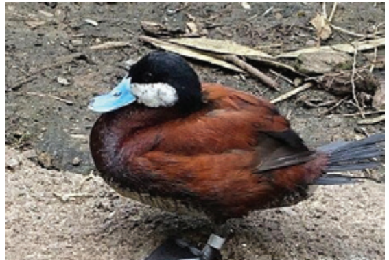
A rare picture of a Ruddy Duck walking; that's because he's at the zoo!

All this combines to make a unique and charming little duck that I love seeing every year at Frank Lake. Make the trip and you might see the Ruddy picking fights and then slowly disappearing under the water to escape them.