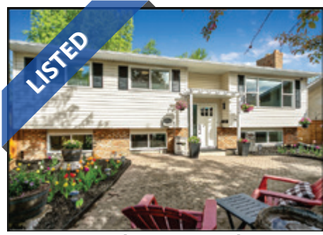
172 Brabourne Road SW