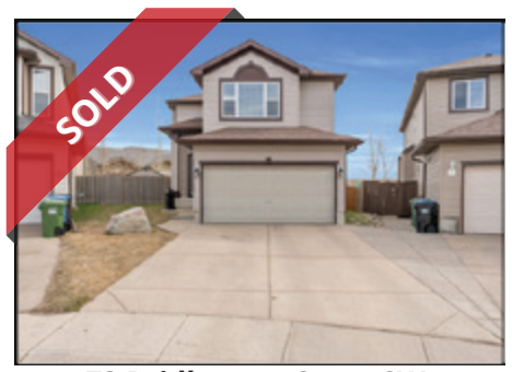
73 Bridlecrest Court SW

3 bedrooms, 2.5 bathrooms & 1,788 sqft. Massive pie shaped lot.