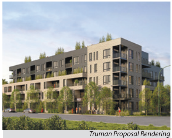
Truman Proposal Rendering

Construction continues on Truman Homes' five-storey 1905 College condo project. This development, while coming at the cost of a number of older homes, is at least of the scale and quality we look for in new projects of this type.