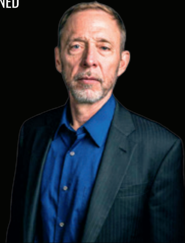
Former FBI hostage negotiator Chris Voss is the CEO and Founder of the Black Swan Group