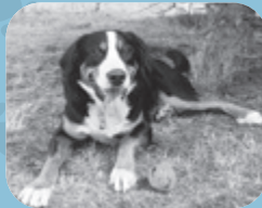
Moose, Canyon Meadows