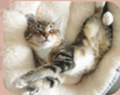
Ravioli, Lower Mount Royal