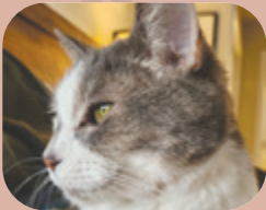
Squeeks, Mount Pleasant