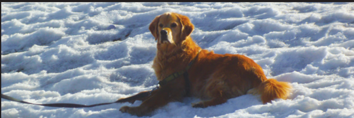
Calgary's Spring of 2024.