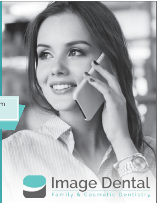
Image Dental Family & Cosmetic Dentistry