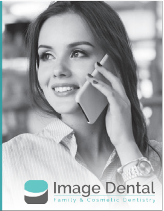
Image Dental Family & Cosmetic Dentistry

Services are provided by general dentists